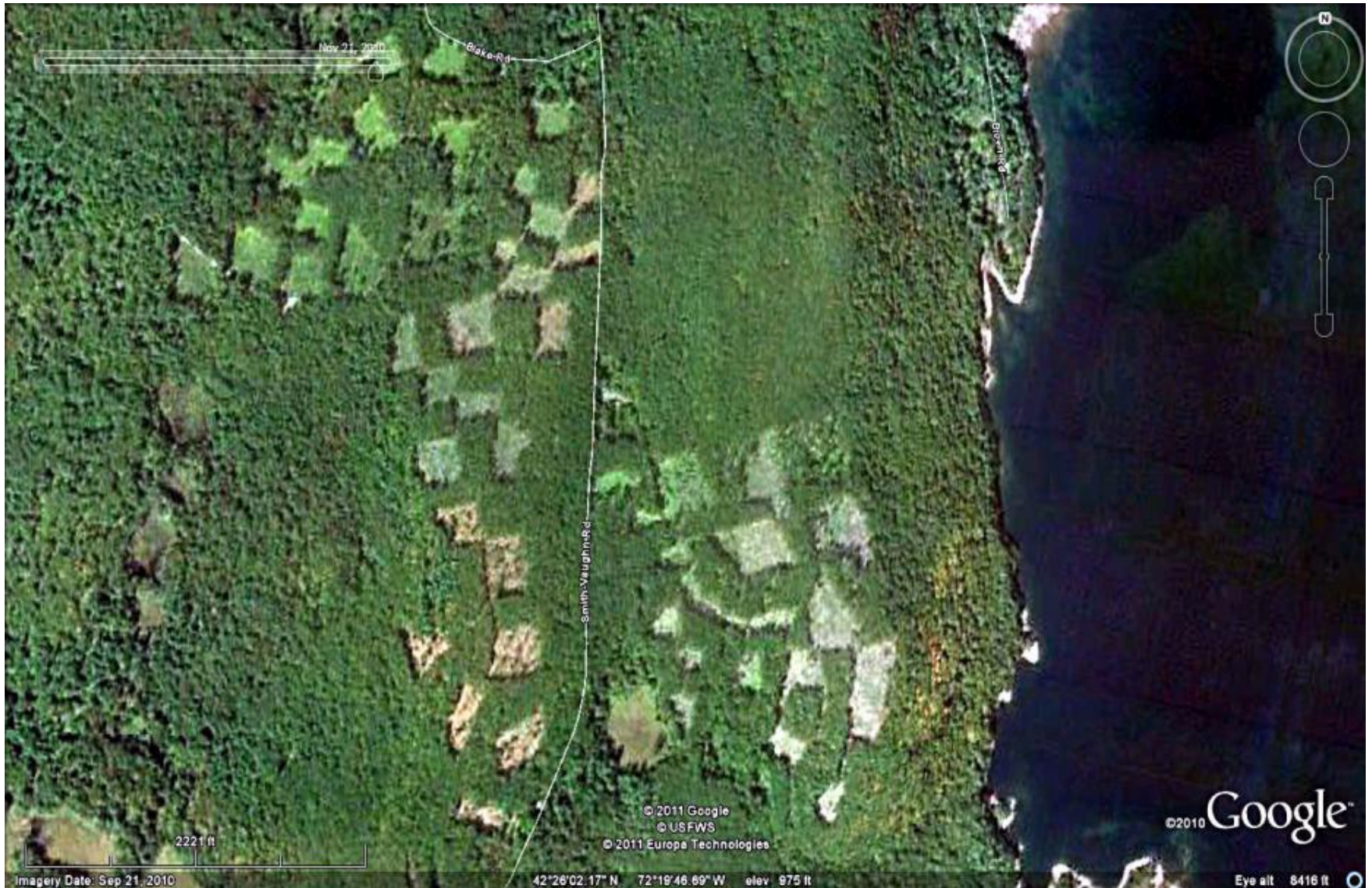
Google Earth View, September 2010