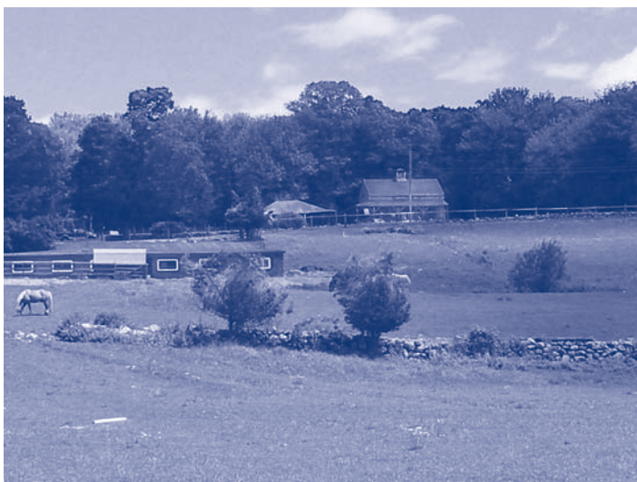
Among the land protection projects completed in fiscal 2011, Sweetwilliam Farm conserved nearly 100 acres, which provided a link to over 2,000 acres of contiguous conservation land.