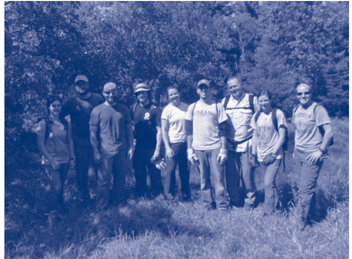
SVT's Stewardship Department provided service opportunities to 208 adults and 235 youths who contributed over 1,800 volunteer hours. This EMS workgroup helped construct the Walnut Hill Trail, a keystone link to trails in Northborough, Westborough, Marlborough and Southborough.